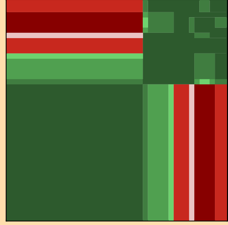
\mu vs. E for ^{195}\text{Os}(\text{mt251})