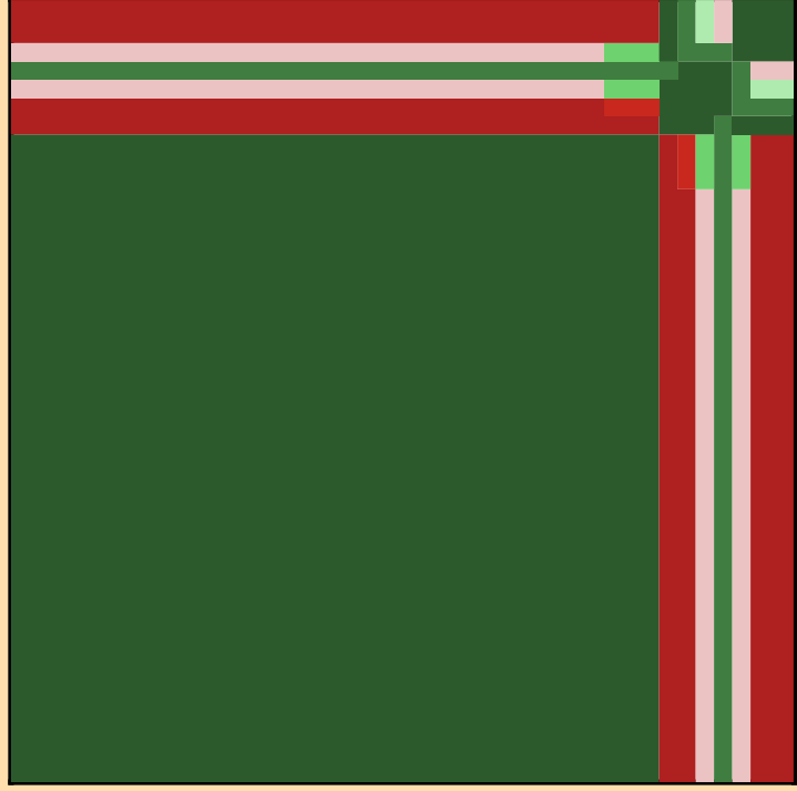
\mu vs. E for ^{200}\text{Po}(\text{mt251})