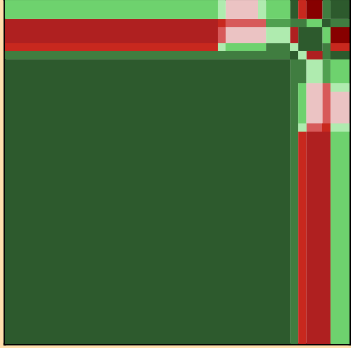
\mu vs. E for ^{172}\text{Tm}(\text{mt251})